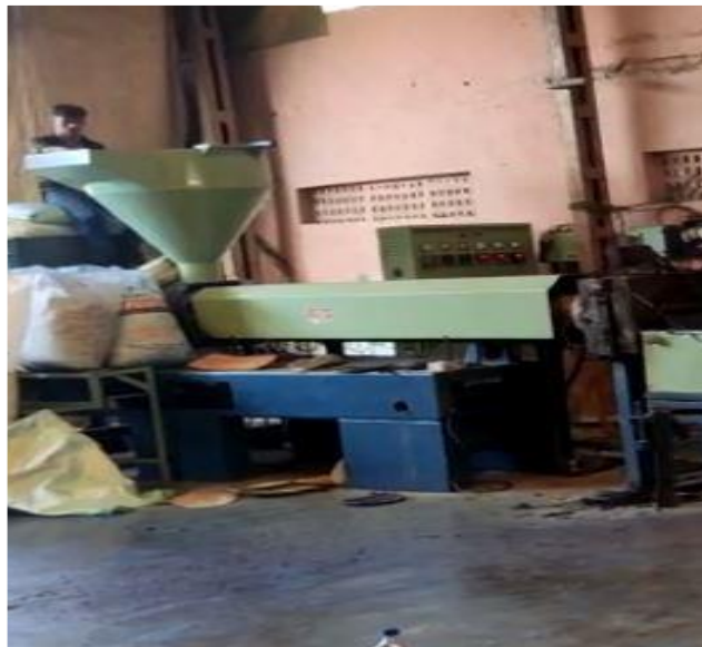
Recycling of MLP / LVP waste