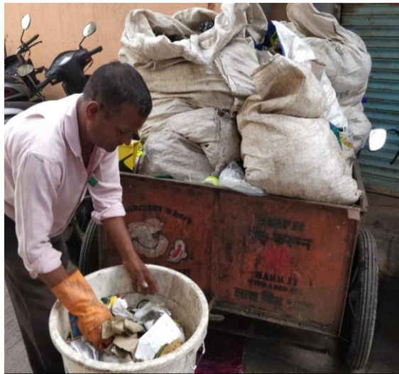
D2D, Gate collection by waste collectors