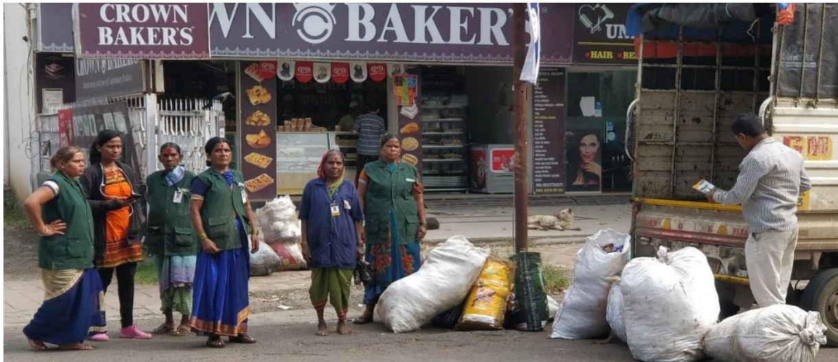
Assembly of waste collectors at feeder point