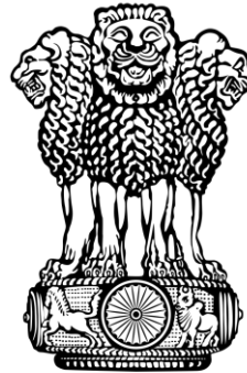
सत्यमेव जयते Government of Puducherry