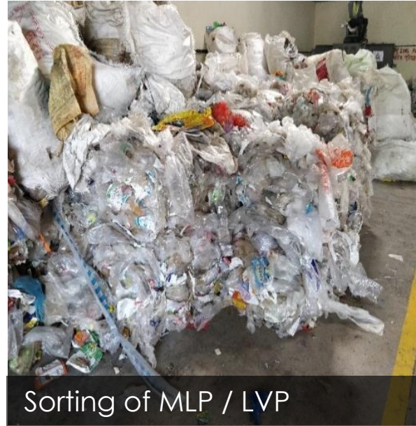
Sorting of MLP / LVP