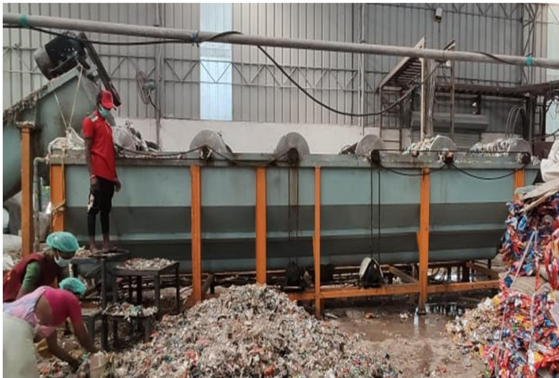
Washing and drying of MLP / LVP