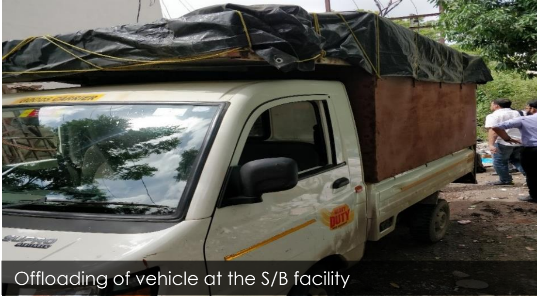
Offloading of vehicle at the S/B facility