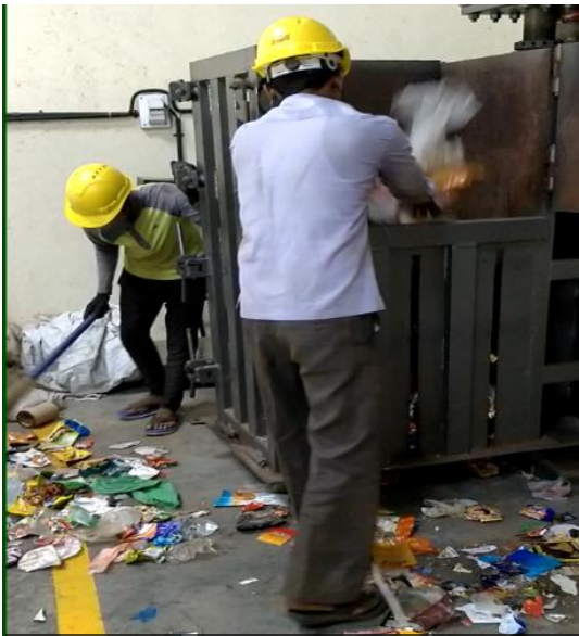
Baling of sorted MLP / LVP waste