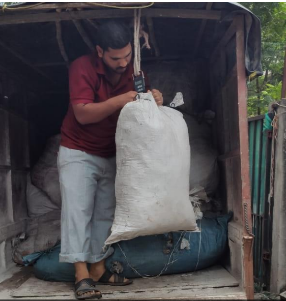
Collection and weighing of waste